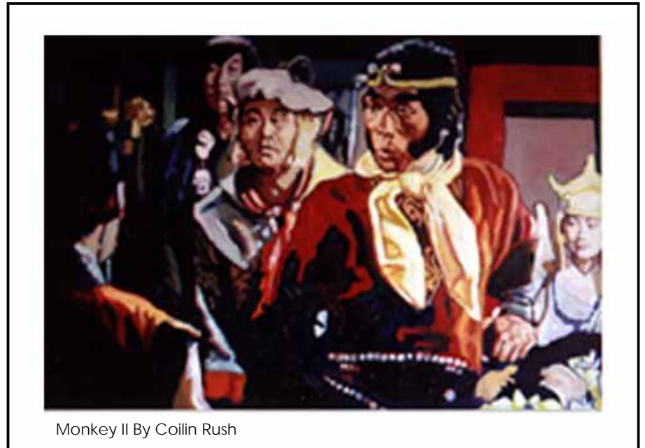
Monkey II By Collin Rush